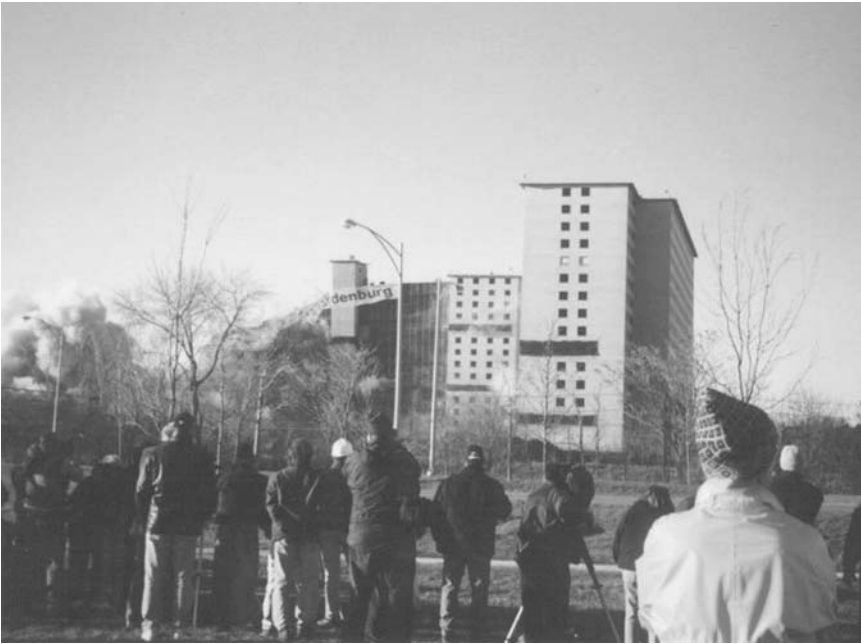
Figure 4 Spectacle of the implosion of four public housing high-rises.

before and which continued to be the symbol of urban poverty elsewhere in Chicago. There were also condescending remarks about the families who would occupy the units: 'They're gonna have apartments with five bedrooms? They're gonna have five families up in there! That's 15 people!'. In general, there were repeated challenges to any proposals related to scattered-site units as if the CHA was going over the number of mandated units when, in reality, construction of replacement housing was proceeding slowly (Devitt, 1998).