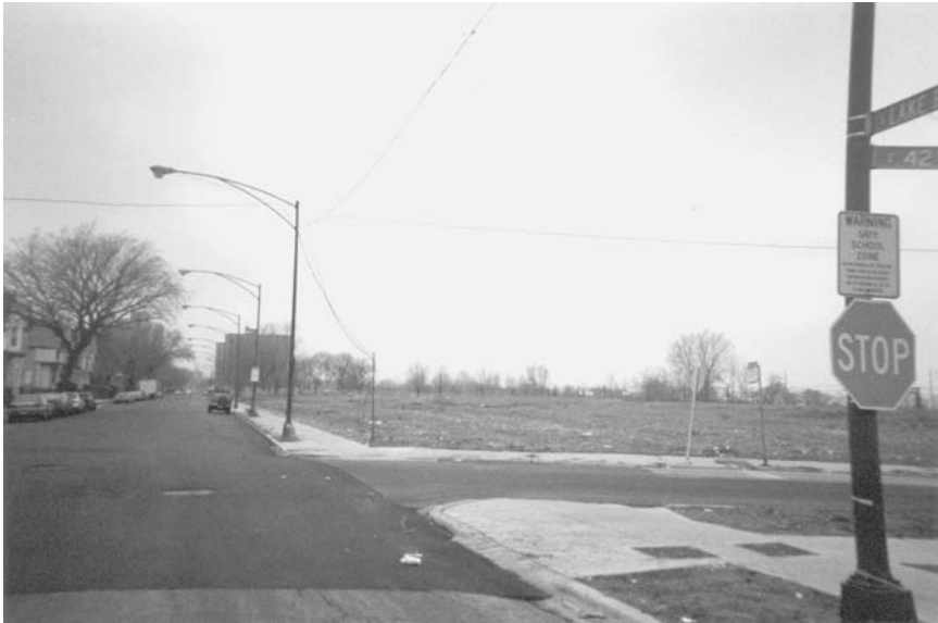
Figure 2 Overgrown and trash-filled vacant lots stretch for nearly a half-mile, making substantial new construction possible.

between 1960 and 1990, following the familiar path of decline and concentrated poverty experienced by many inner city black neighborhoods (Wilson, 1987). The official poverty rates in North Kenwood and Oakland in 1990 were 51 percent and 70 percent respectively, median family income was roughly $10,000, and unemployment was over 30 percent. The timing of NKO's designation as a Conservation Area in 1990 is fortuitous for gauging neighborhood change, with the 1990 and 2000 censuses serving as benchmarks. The overall demographic story shows relatively slow but sure upward socioeconomic change. Part of this could reflect the improving circumstances of people who already lived there, but observation suggests more strongly that it is the result of new, more affluent people moving in. According to the 2000 census, 58 percent of the residents of NKO had moved into their residences since 1995, illustrating significant influx. All of those newcomers are not, however, affluent; in 2000, Oakland was still the second poorest of Chicago's 77 communities in terms of income, and had the third highest neighborhood poverty rate. North Kenwood was twelfth out of 77 community areas in median family income, and had the eighth highest poverty rate. Table 1 summarizes the census data over this time period, while the discussion below offers more particular explanations.