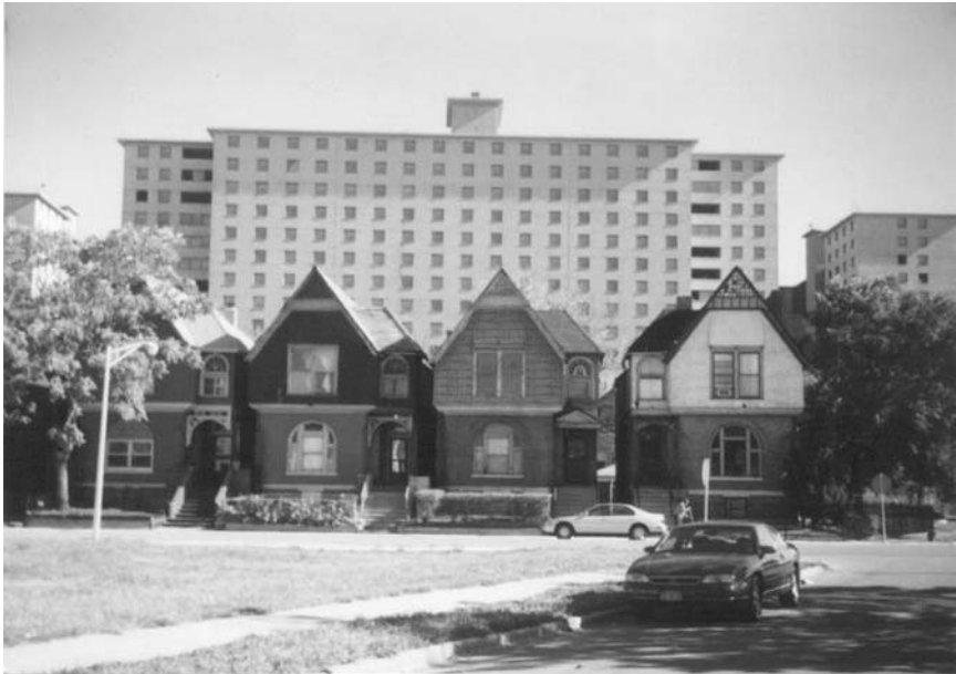
Figure 1 NKO's heterogeneous landscape includes vacant lots, rowhouses, and public housing.

Consolidation Act of 1961. The development goal of a 'Conservation Area' is to renew the existing structures and neighborhood fabric, as opposed to the goals for a slum or blighted area, which connotes demolition, clearance (of structures and people), and rebuilding (Illinois Revised Statutes, 1961). Urban renewal has a long and storied history in American cities, perhaps best told in Herbert Gans' (1962) ethnography of the destruction of Boston's West End neighborhood. That area was leveled in order to make way for a completely new neighborhood of high-rises for people more wealthy than the working class (mostly) Italians who had once called it home. The hope in NKO is explicitly not to revisit that era of urban planning, but instead to build within the parameters of the existing landscape, which is dotted with large empty lots, interrupted by landmarked row houses, and towering 1950s public housing (see Figure 1).