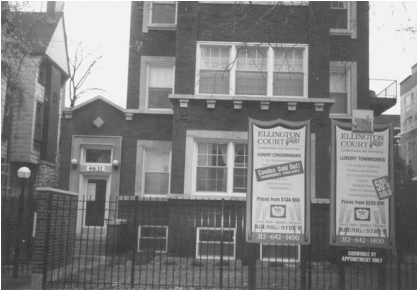
Figure 5 Ellington Court, named after African American jazz great Duke Ellington, development signifies the black presence in NKO.

Indeed it is their very public use of what others define as private space (barbecuing on porches, partying all night next door) that fuels controversy. '[E]ach lifestyle can only really be constructed in relation to the other, which is its objective and subjective negation', writes Bourdieu (1984: 193). These mutually contested lifestyles reflect distinctions of capital resources – employed versus unemployed, taxpayer versus freerider, homeowner versus renter. These evident distinctions necessitate a reconsideration of monolithic and static depictions of black communities.